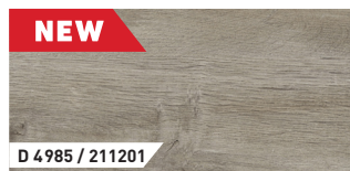
Oriental Oak Grey | 1-Strip | ER | V4