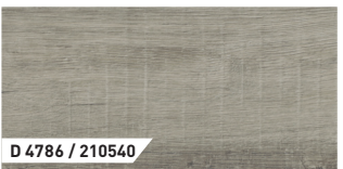
Gala Oak Grey | 1-Strip | ER | V4