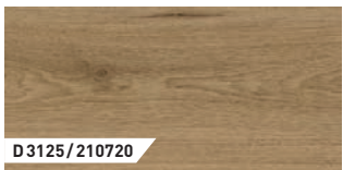
Trend Oak Nature | 1-Strip | PR