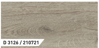
Trend Oak Grey | 1-Strip | PR