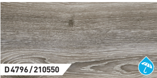
Highland Oak Titan | 1-Strip | ER | V4