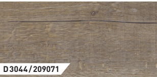
Rift Oak | 1-Strip | MX | V4