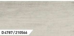
Gala Oak White | 1-Strip | ER | V4