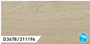
Toulouse | 1-Strip | ER | V4