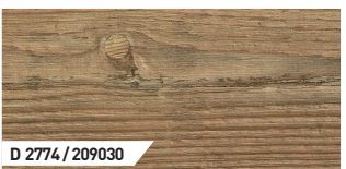
Natural Pine | 1-Strip | MX | V4