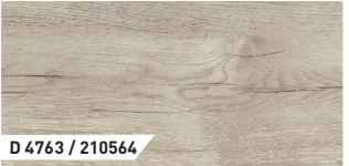
Petterson Oak Beige | 1-Strip | ER | V4