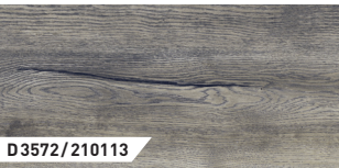
Harbour Oak Grey | 1-Strip | ER | V4