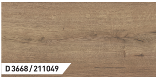
Oak Dezent | 1-Strip | AF | V4