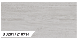
Trend Oak White | 1-Strip | WG | V4