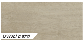
Summer Oak Beige | 1-Strip | WG | V4