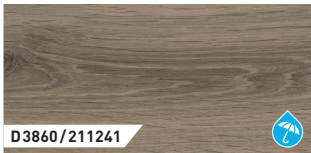
Ferrara Oak | 1-Strip | ER | V4