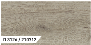
Trend Oak Grey | 1-Strip | WG | V4