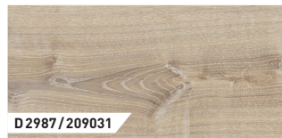
Whitewashed Oak | 1-Strip | MX | V4