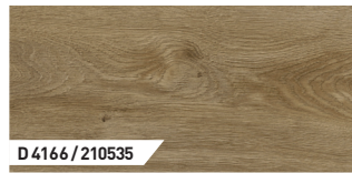
Prestige Oak Nature | 1-Strip | ER | V4