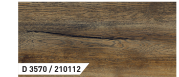
Harbour Oak | 1-Strip | ER | V4