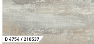
Oak Hella | 1-Strip | UL | V4