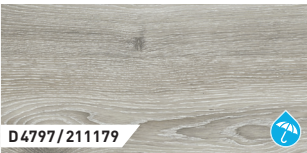
Highland Oak Silver | 1-Strip | ER | V4