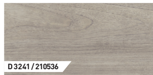
Nostalgie Teak Beige | 1-Strip | ER | V4