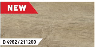
Oriental Oak Beige | 1-Strip | ER | V4