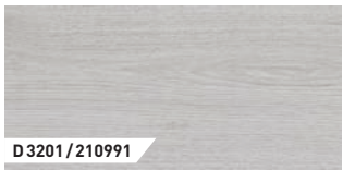
Trend Oak White | 1-Strip | PR