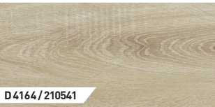
Village Oak | 1-Strip | MX | V4