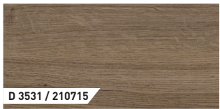
Millennium Oak Brown | 1-Strip | WG | V4