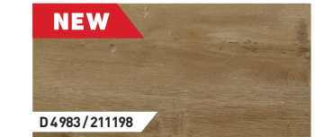
Oreintal Oak Nature | 1-Strip | ER | V4