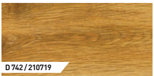
Sutter Oak | 1-Strip | PR