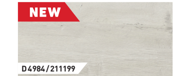
Oreintal Oak White | 1-Strip | ER | V4

PANEL 1380 x 244 x 8 mm BOX 8 panels | 2,694m 2 PALLET 42 boxes | 113,138 m 2