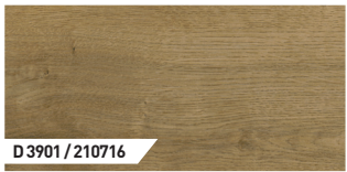
Summer Oak | 1-Strip | WG | V4