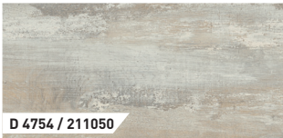
Oak Hella | 1-Strip | UL | V4