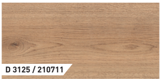
Trend Oak Nature | 1-Strip | WG | V4