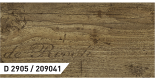
Route des Vins Foncé | 1-Strip | WG | V4