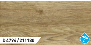
Makro Oak Nature | 1-Strip | ER | V4